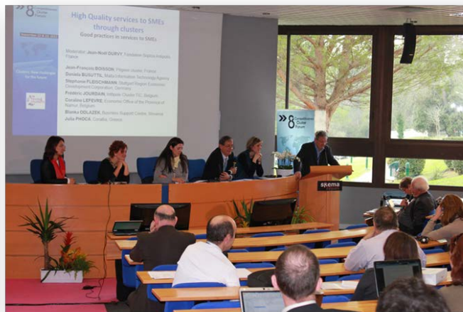
Panel Discussion - Good practices in services to SMEs