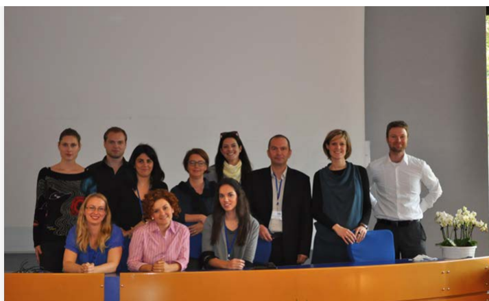
The P4C consortium