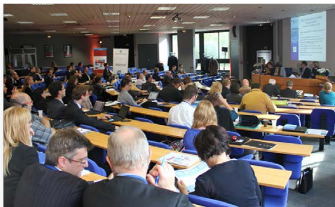
P4C Final Conference's highlight